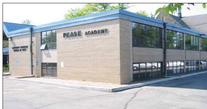
The northwest curb after (above) and before (below).