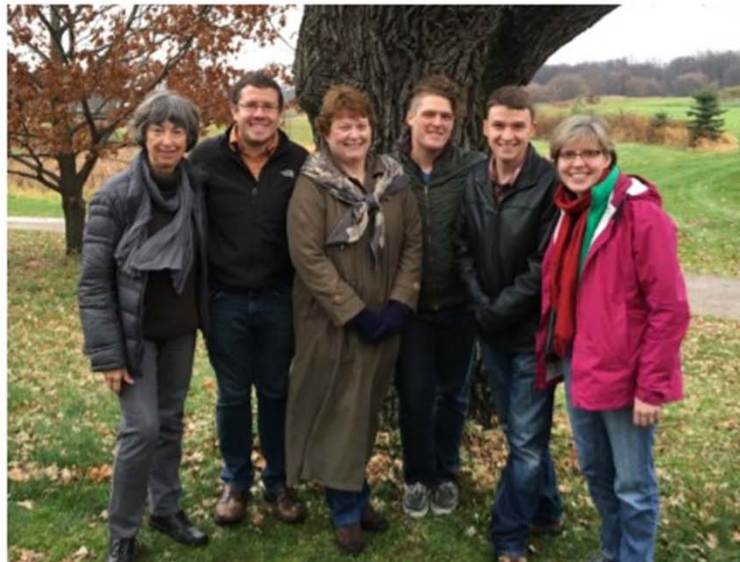
Our love and gratitude this season, and always.

We are so grateful to partner with you in ministry.