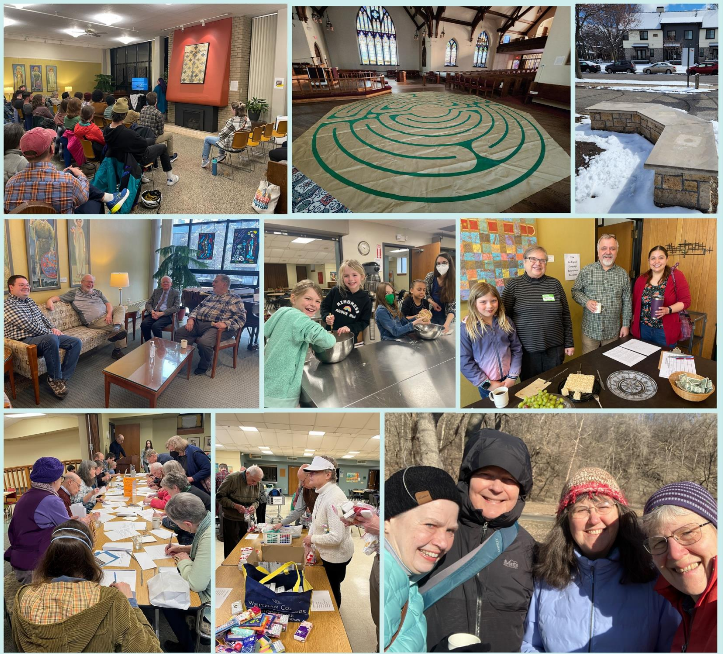
Clockwise from top left: The Gather young adult event at Hope in March (hearing about a “source to sea” paddle down the Mississippi with a focus on decolonizing); the labyrinth; the newly built stone bench all ready for some warm weather and great pizza and bread bakes; enjoying fellowship time; a hearty Wild Church gathering on a cold March day; packing supplies in backpacks for Conversations with Friends (these backpacks may be requested by those who are about to be deported by ICE); Bread for the World letter writing; enjoying after-church conversation; and (center) making our Maundy Thursday communion bread (thank you, Sunday School students!).