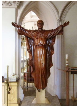
Risen Christ , Anonymous Artist, 20th c. Uganda

University Lutheran Church of Hope is a welcoming, Christian community of faith centered on God's grace and called to demonstrate God's love for the world. University Lutheran Church of Hope is a Reconciling in Christ congregation and a sanctuary congregation with a commitment to racial equity.