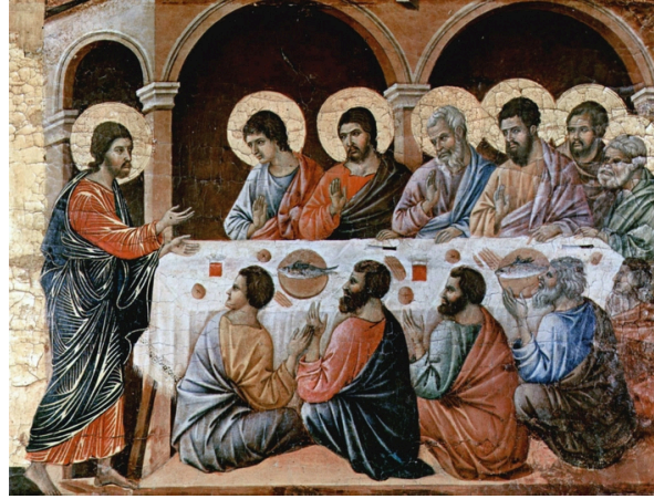
Christ Appears to the Disciples at the Table after the Resurrection by Duccio di Buoninsegna (d. 1319)

University Lutheran Church of Hope is a welcoming, Christian community of faith centered on God's grace and called to demonstrate God's love for the world. University Lutheran Church of Hope is a Reconciling in Christ congregation and a sanctuary congregation with a commitment to racial equity.