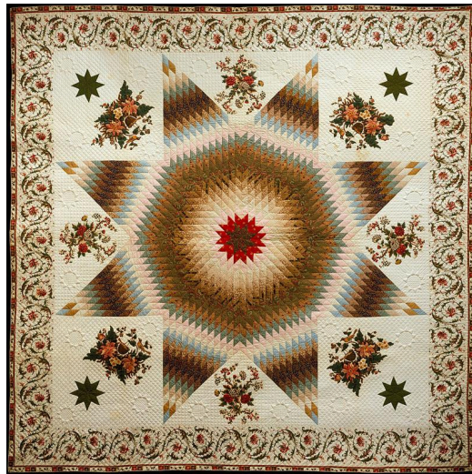
Star of Bethlehem Quilt, Anonymous Artist, ca. 1835, USA

University Lutheran Church of Hope is a welcoming, Christian community of faith centered on God's grace and called to demonstrate God's love for the world. University Lutheran Church of Hope is a Reconciling in Christ congregation and a sanctuary congregation with a commitment to racial equity.