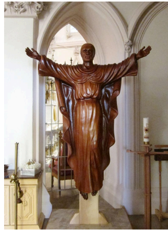
Risen Christ , Anonymous Artist, 20th c. Uganda

University Lutheran Church of Hope is a welcoming, Christian community of faith centered on God's grace and called to demonstrate God's love for the world. University Lutheran Church of Hope is a Reconciling in Christ congregation with a commitment to racial equity.